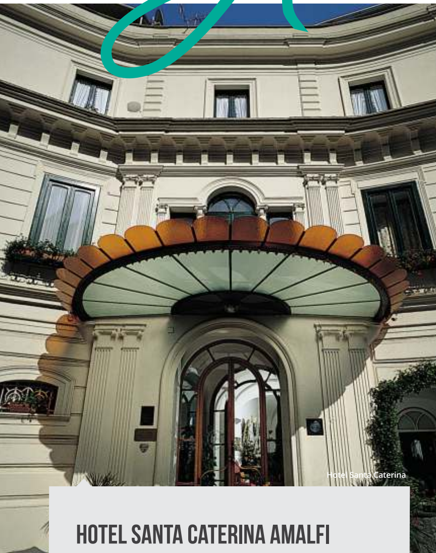
Hotel Santa Caterina