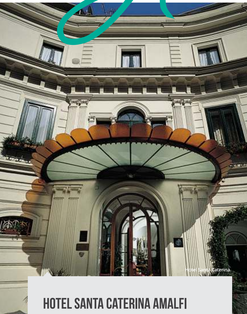
Hotel Santa Caterina